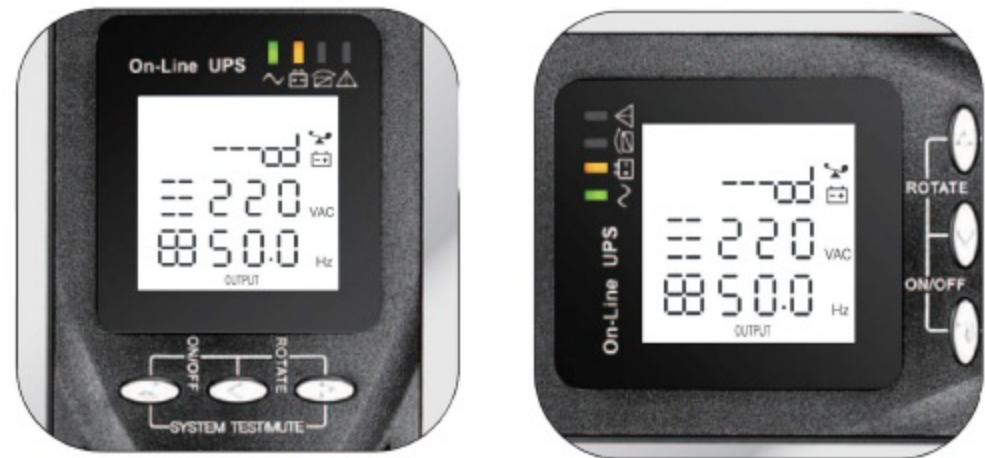
Two directions LCD display